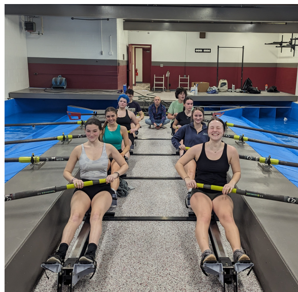
New: Completely refurbished tank room!

Veterans Rowing: WSRC has partnered with USRowing Freedom Rows program to offer training, both on and off the water, specifically tailored to military veterans and members of the armed forces who have disabilities.